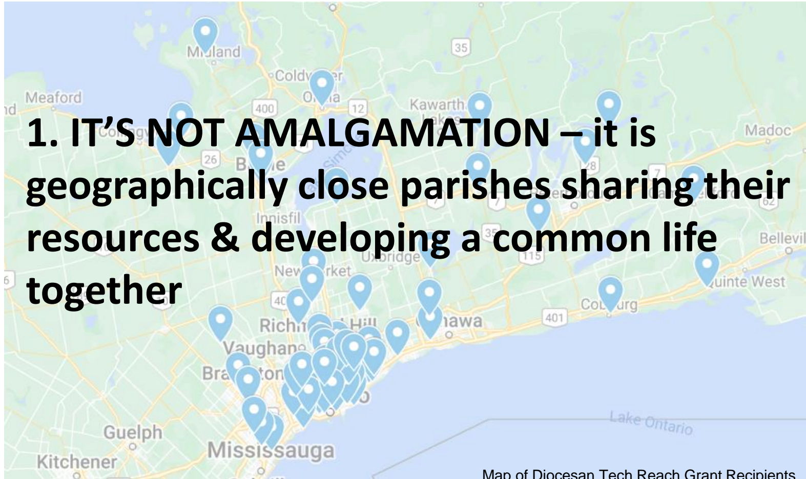
Map of Diocesan Tech Reach Grant Recipients

1. IT'S NOT AMALGAMATION – it is geographically close parishes sharing their resources & developing a common life together