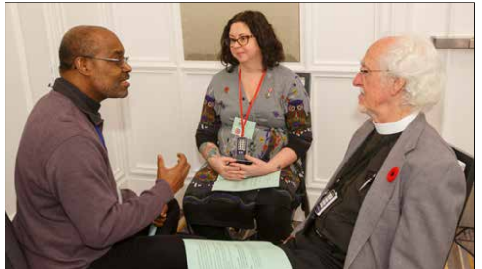
Synod members share thoughts on proposed changes to the Marriage Canon.

The proposed changes to the Marriage Canon to incorporate a provision