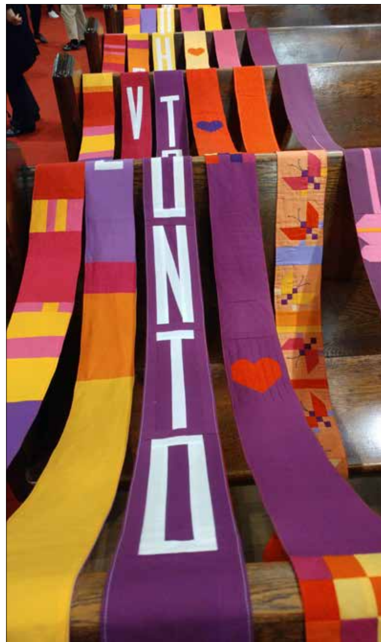
Banners are draped across pews at St. Barnabas, Chester.