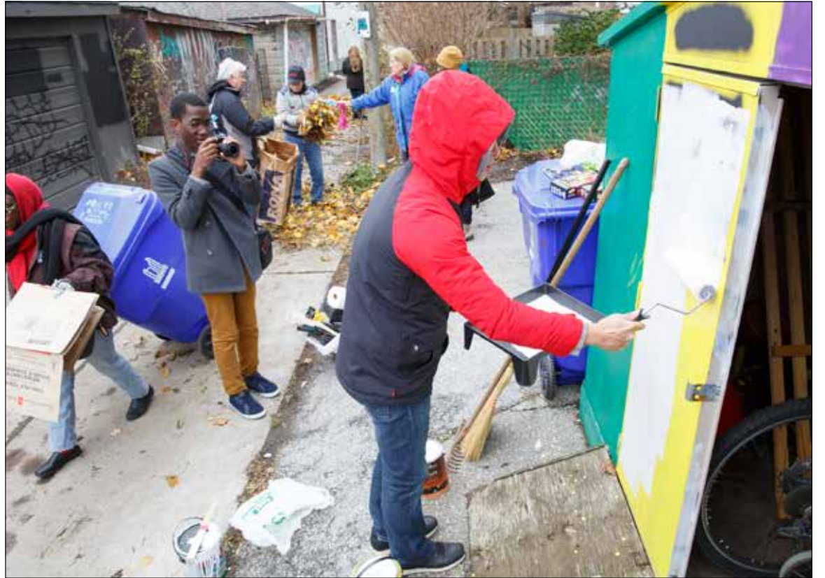
A volunteer paints the shed behind St. Margaret, New Toronto during a cleanup of the property.

After the graffiti was painted over, the man struck again in early October and then again on Oct. 28