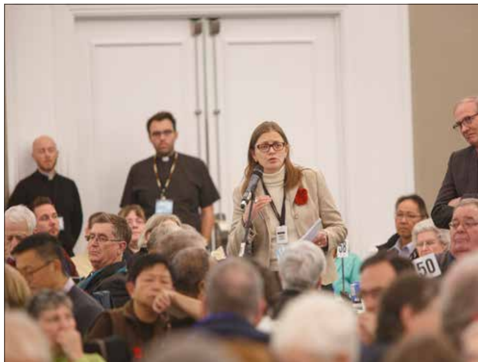
Synod members debate a motion that would change the way diocesan and coadjutor bishops are elected.