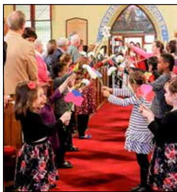
Children create a flower arch for the bride at St. Peter, Erindale.

A number of parishioners volunteered their time and talents for the wedding. One parishioner served as the Master of Ceremonies for the reception afterwards, while another parishioner baked the cake. Parishioners decorated the church, brought punch and champagne and even booked a room for the